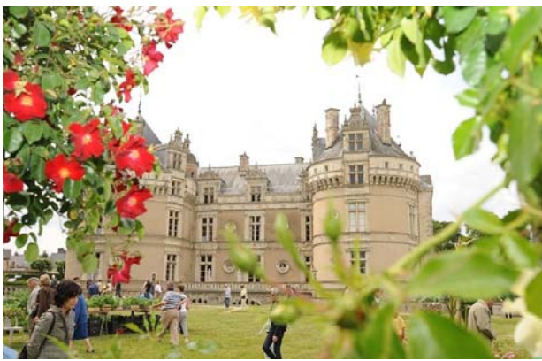
Un week-end des jardiniers au Lude

Saturday afternoon, the highlight of the weekend, sees the official announcement