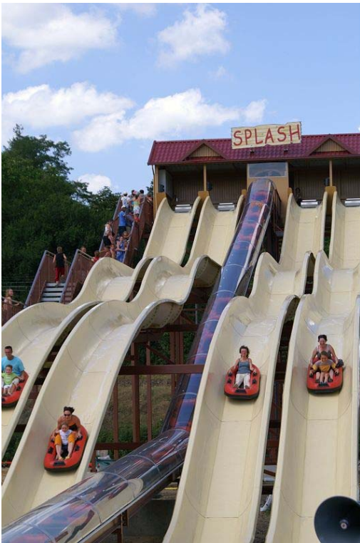
Splash-Papéa Parc