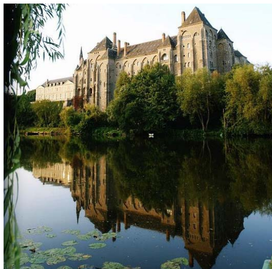
Abbaye de Solesmes

Grand Hôtel de Solesmes http://grandhotelsolesmes.com