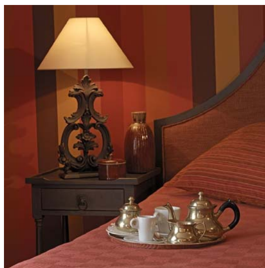
Grand Hôtel de Solesmes