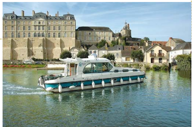
Tourisme fluvial sur la Sarthe

- allow €350 for a week with this Skellig model.