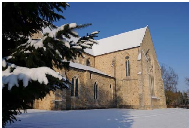
Abbaye de l'Epau