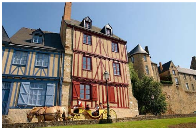
La Cité Plantagenêt

In Sarthe our religious buildings and historical sites such as Solesmes abbey and the Cité Plantagenêt in Le Mans, an Art and History Town, win the admiration and reverence of visitors due to the beauty of their architecture and their history. The towns and villages offer a rich historical and architectural heritage while the many museums provide the keys to understanding the history of the Maine region. The exceptionally rich heritage of the Perche sarthois and the Loire Valley has brought them the high distinction of being listed as Lands of Art and History.