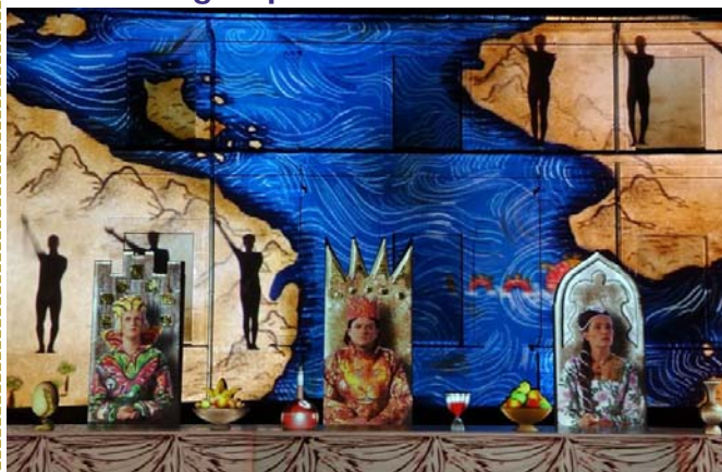
Le Banquet ©Gilles Moussé - Création Skertzo pour la Ville du Mans

Since 2005, a spectacular performance (staged by Skertzo) has taken place during the summer every evening from nightfall. The Night of Dreams (Nuit des Chimères) is a high quality show projected onto the town's monuments, such as the banquet of the Plantagenêts on the front of the Conservatoire. New! For the 1 st time in 2011, the period of the Night of Dreams will be extended: from the end of June to the beginning of September and from mid-May to October for groups.