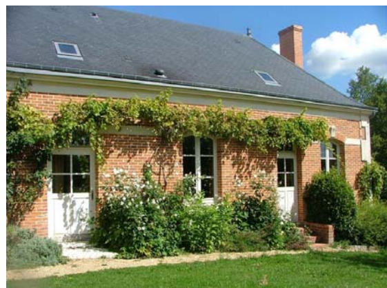
Les Tropes