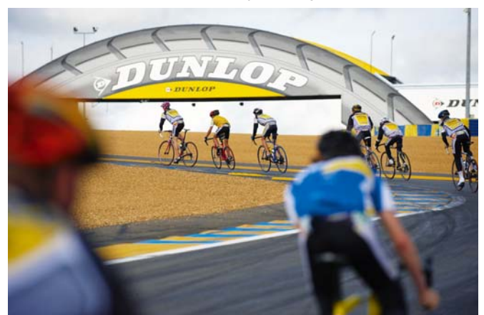
24 Heures vélo