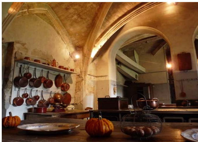
Cuisine au château