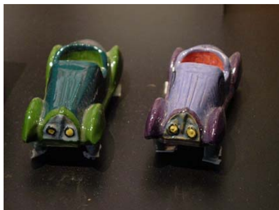
Faïences de Malicorne